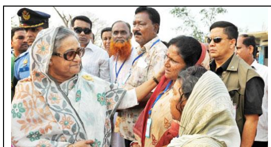
The Prime Minister is talking with the victims

The Honourable Prime Minister visited tornado affected areas on 25th March 2013.