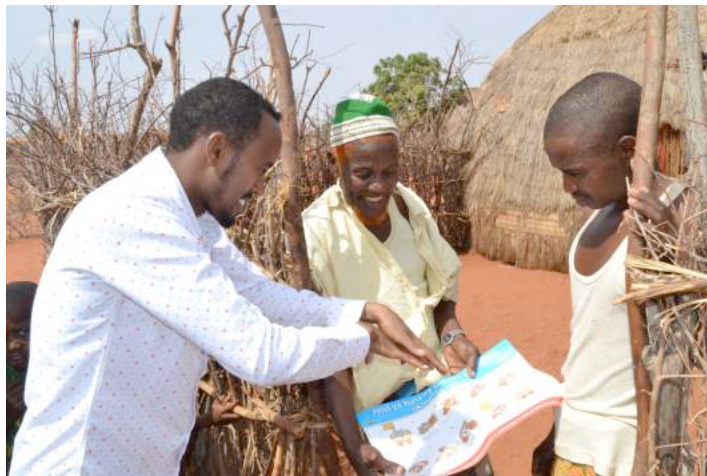
A PHO from Mandera County in the Ministry of Health using a chart to illustrate the proper hand-washing procedure.

The social mobilization team partnered with Public Health Officers (PHOs) from the Mandera County Government to conduct sensitization exercises on cholera and Chikungunya prevention and management. The social mobilization team has been conducting revisits of households to ensure there is no re-emergence of new cases.