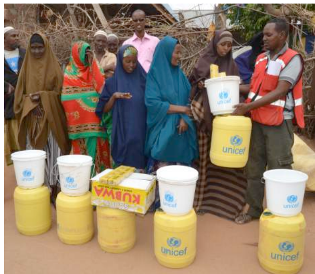
A group of community women receiving NFIs.