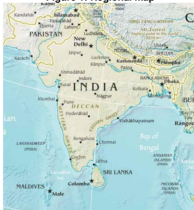
Figure 1: Regional map