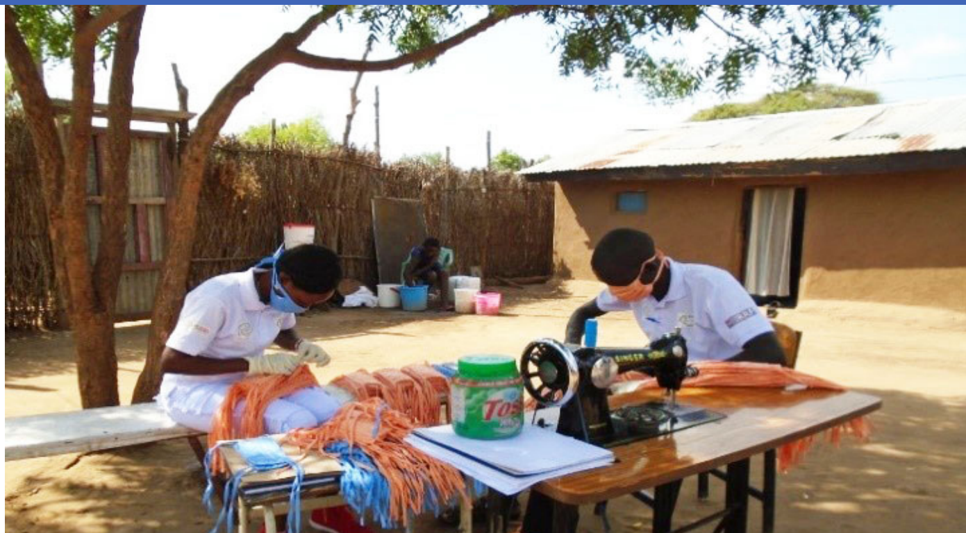
Care for Humanity Organization (CfHO) face mask production