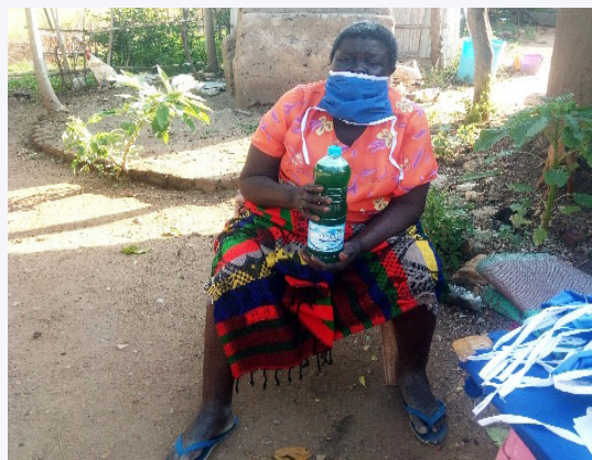
CfHO mask and soap recipient

markets with others because now I have face mask. I can protect myself from the virus and be able to sell my vegetables without fear.”