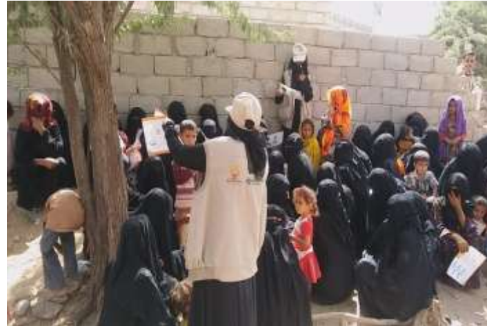
Figure 3: Gathering a huge number of people to explain the importance of personal hygiene as well as solid waste disposal.

Five of our community volunteers have conducted 15 awareness sessions on personal hygiene and solid waste disposal, targeting 500 individuals disaggregated (177 male, 313 female) in Al-Ahmol area of Fara Al-Udayin district of Ibb Governorate. They also distributed soap bars, hand towels, and brochures about (chlorination, water purification, and hygiene practices).