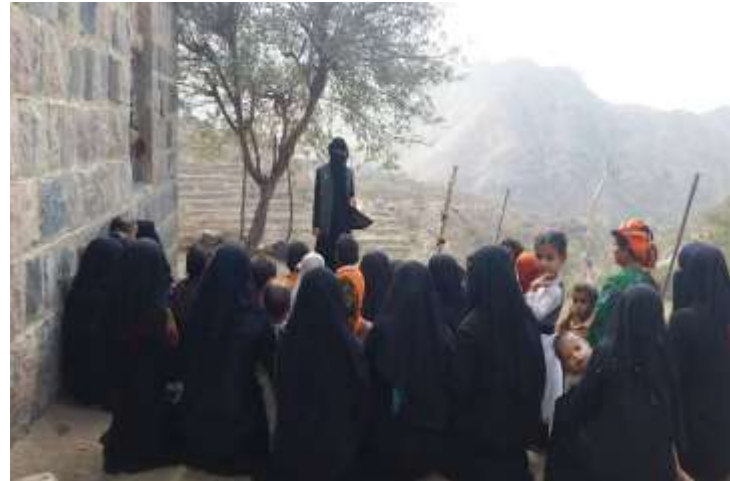
Figure 3: Conducting awareness sessions about important health and nutrition key messages in hard-to-reach areas.

As we continue the rehabilitation of Al-Hasha water well, the contractor has installed a solar pumping unit with all accessories to enable beneficiaries get water out of the well. Approximately 1,784 individuals of IDPs and affected host community (824 women, 796 men, 164 children) are benefiting from this project.