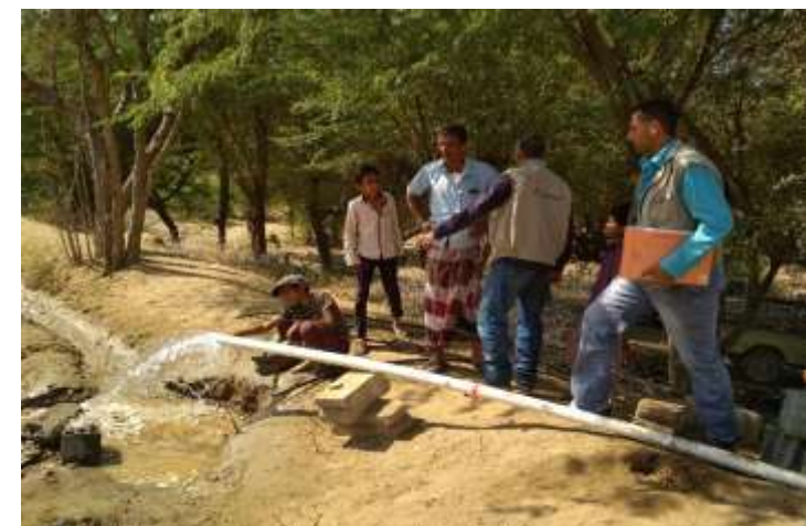
Figure 2: Pulling water out of the well after the installation of the solar pumping unit.