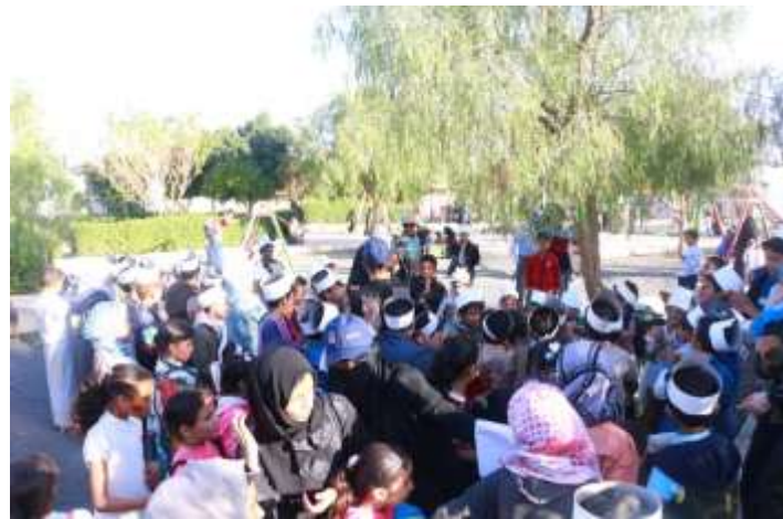
Figure 1: Conducting psychosocial support for 157 children through the project of child friendly spaces in Amanat Al-Asimah Gov.

Our Protection team has conducted different PSS activities, benefiting 157 children within the project of Child Friendly Spaces (CFSs) in Qairawan Park, As Sabain District of Amanat Al-Asimah Governorate. These activities included drawing, coloring, hand crafts, reading, acting, singing and different kinds of sports, targeting children from the age of 2 to the age of 18 years old.