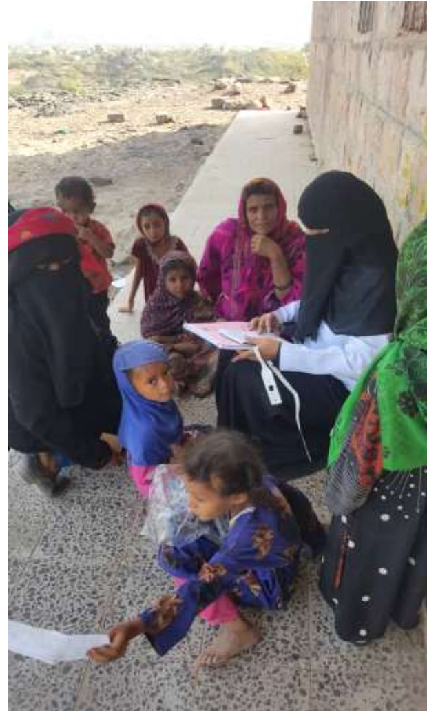
Figure 1: Providing TSFP services for under five children and PLW through our mobile clinics.

This program aims to prevent all children under 2 years and pregnant and lactating women from being acutely malnourished through the provision of Plumpy'Doz for children under 2 years and Super Cereals Plus for (PLW). In January RDP nutrition teams have distributed 204.582 Metric tons of Super Cereal plus for 34,097 Pregnant Lactating Women (PLW) and 36.35 Metric Tons of Plumpy'Doz for 24,230 children under 2 in approximately 104 Food Distribution Points (FDPs) over four Districts of Ibb Governorate.