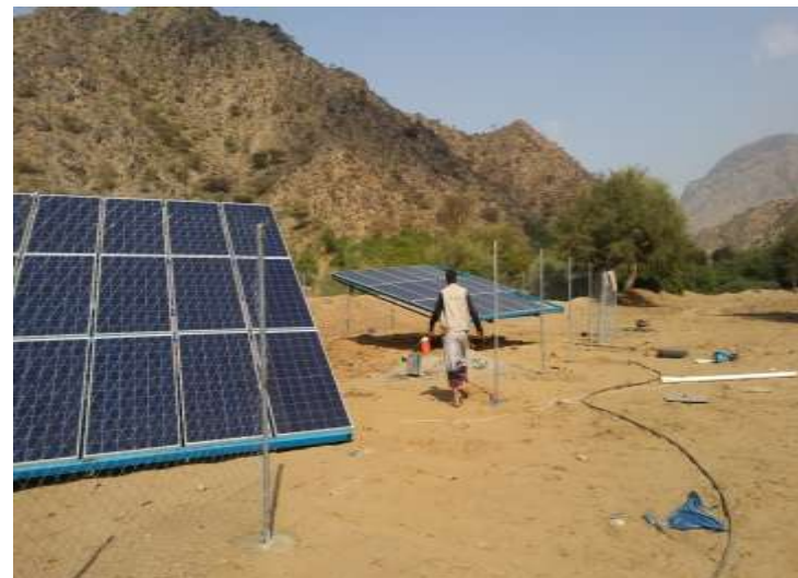
Figure 1: Installing solar pumping unit for Al-Hasha water well in Fara Al-Udayn district of Ibb Gov.