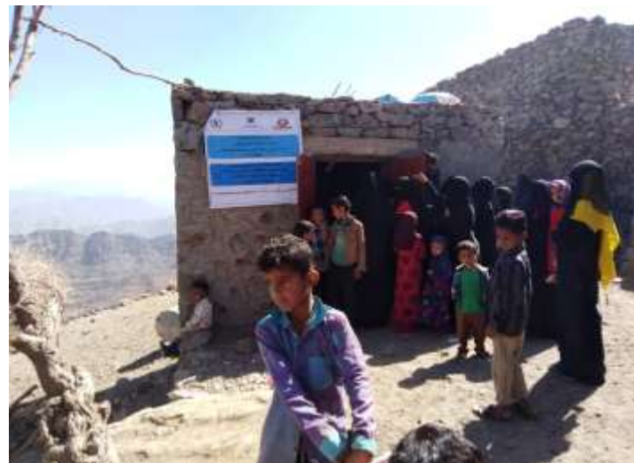
Figure 2: Providing BSFP services in a rugged cliff of a mountainous spot as it is one of our 104 FDPs over four districts.