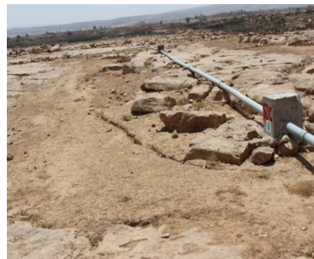
Figure 3 - Water Pipe Construction

Solid Waste Management (SWM) : In Houth and Al-Qafla IDP camps, 514 HHs with 115 men, 167 women, 150 children participated in 9 cleaning campaigns.