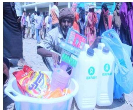
Figure 4 - Hygiene kits distribution

Lead by the implementing partner of Oxfam in Taiz GwQ ( Generations without Qat ) and facilitated by CHVs a total of 3,488 beneficiaries in three districts of AlModafar, AlQahira, and Salah were reached through 211 hygiene sessions focusing on the personal hygiene and diseases prevention such as cholera, typhoid, dengue fever and AWD.