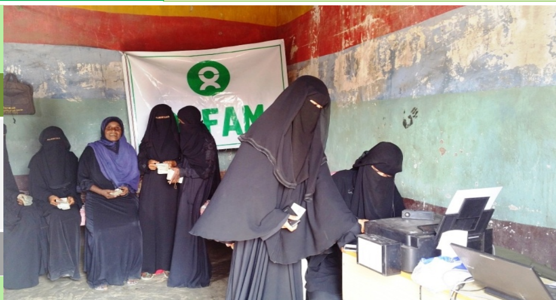
Unconditional Cash Distribution - Al-Kadaha Village . March 2017