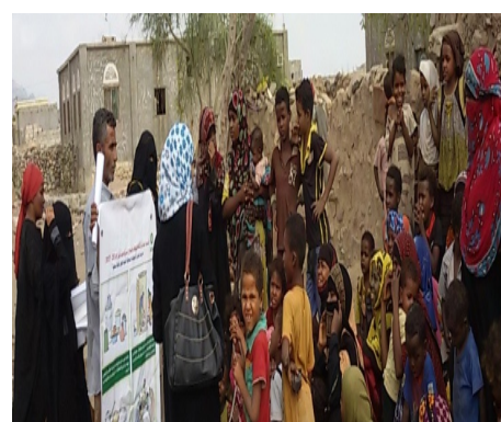
Figure 6 - PHP sessions