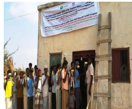
Figure 1 - CFW wages distribution

In addition, the team conducted a total of 172 community awareness sessions in Abs and Hayran districts reaching 2,184 HHs. The main topic was hand washing, water conservation and how to prevent diseases such as acute diarrhoea and scabies. Another 3,525 households (2,599 male and 926 female) received hygiene soap kits in Abs district.