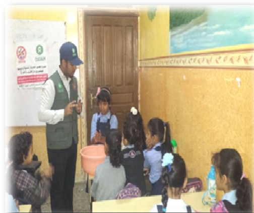
Figure 5 - PHP sessions in Schools - Taiz