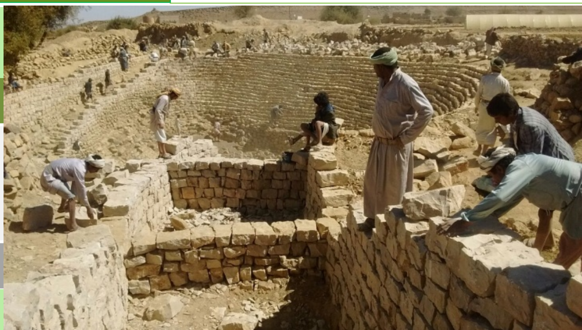
Cash For Work Activity at Water Tank - Amran governorate . February 2017