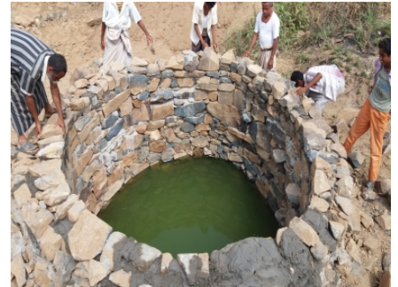
Figure 1 - CFW activity

Cholera Response: Oxfam WASH staff started WASH activities such as water trucking, water chlorination, latrine construction and hygiene promotion at four locations within Al-Zuhrah city, Kedf Abdu Hadi and Aldhebah sub-districts. A total number of 159 AWD cases in Oxfam targeted areas were reported by health office in Al-Zuhrah district (21% adult male, 19% adult female and 60% children under 5 years) .