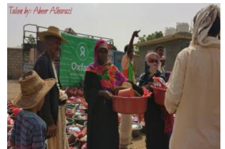
Figure 2- Hygiene kits distribution - Shafar