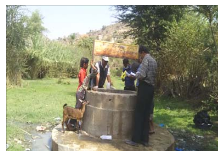
Figure 4- Water Disinfection - Taiz

Cholera Response: During this reporting period, a total of 1,132 cubic meter of water was disinfected using a total of 3,792 grams of chlorine powder HTH. The intervention benefitted 3,224 HHs in Maqbana and Sharab As Salam districts.