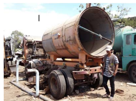
Figure 5 - Water Pipeline Construction - Aden