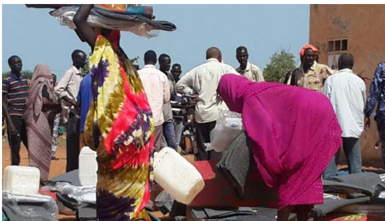
South Sudanese refugees in Kharasana, West Kordofan

Some 8,500 primary school children in Blue Nile's Geissan locality have been targeted for a school feeding programme aimed to encourage school enrolment. The Adventist Development and Relief Agency (ADRA) in Blue Nile State signed a technical agreement with HAC to implement this programme. This is the second phase of