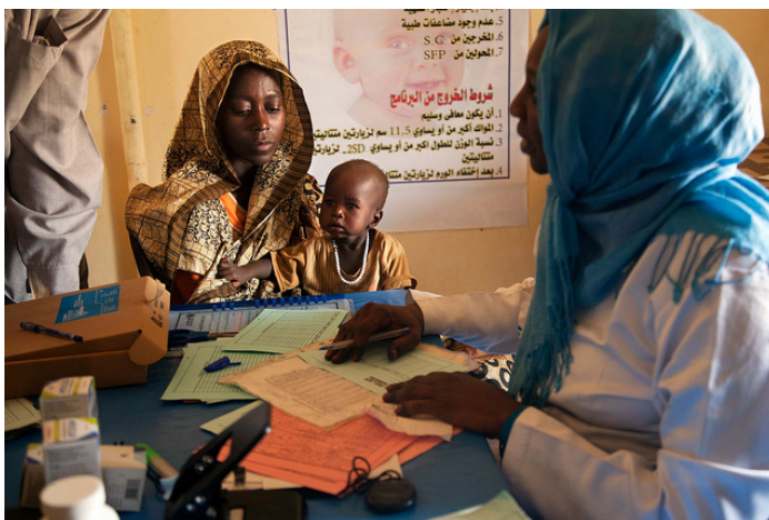
IDP woman receiving health assistance in a North Darfur clinic

An estimated 2,000 people in Central Darfur's Zalingei locality—whose homes were damaged by heavy rains and are living under trees and in temporary shelters—are in