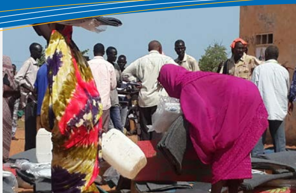
South Sudanese refugees in Kharasana (GHA)