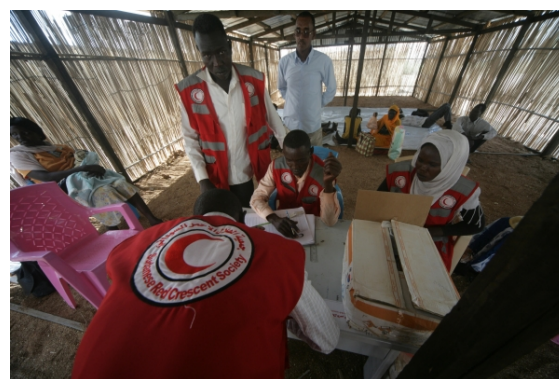
A SRCS team registers new South Sudanese arrivals in White Nile State

Individual registration in Jouri camp in White Nile State is set for completion on 14 May. UNHCR and Sudanese Red Crescent Society (SRCS) teams registered just over 6,500 people (1,600 families) since 15 April. This is a reduction of more than 30 per cent of numbers captured in previous household registrations, representing a slightly higher than average percentage change. Registration teams will begin working in Al Kashafa camp as soon as Jouri camp registration is finalized, and will begin in El Redis camp by 21 May.