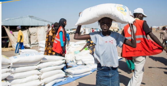
A young girl receives food supplies in White Nile State (UN)