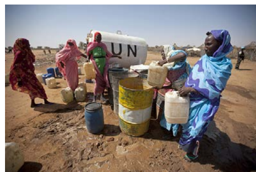
IDPs collect water from a tank in South Darfur

Permit delays for WES halted the delivery of much needed fuel to Al Salam IDP camp in South Darfur in the first week of May. As a result, WES water networks could not function properly, leading to acute water shortages in the camp. However, successful transport of the fuel on 6 May allowed water operations to resume. The water supply in Al Salam camp now stands at 11.7 litres per person per day. Similar reports of water shortages in other South Darfur IDP camps (Kalma, Otash, El Serif, Sakeley, Dereige) have likewise been resolved in the past weeks thanks to successful fuel deliveries. Temporary movement restrictions on humanitarian partners in late April due to the tense security situation had caused the delays.