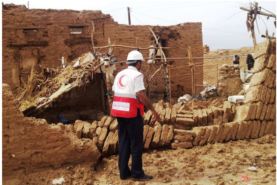
Conducting humanitarian assessments in Shabwah governorate

As agencies, authorities and the population try to cope with the impact of Cyclone Chapala and the conflict that has ravaged Yemen for the past eight months, a new cyclone is making its way towards the Yemen coastline. Tropical Cyclone Megh is currently in the Arabian Sea about 920km east-northeast of Socotra Island. It is predicted to move west-southwest and to intensify into a severe cyclonic storm in the next 24 hours, continuing towards the Gulf of Aden and gradually weakening.