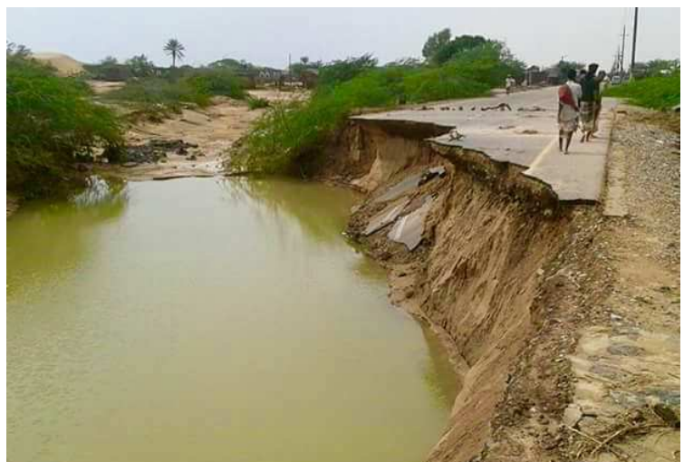
Damage to highway in Shabwah

Damage to main highways, particularly those into Al Mukalla, the on-going conflict and related insecurity limit the delivery of emergency relief supplies. Communications with Al Mukalla are also limited. Nevertheless,