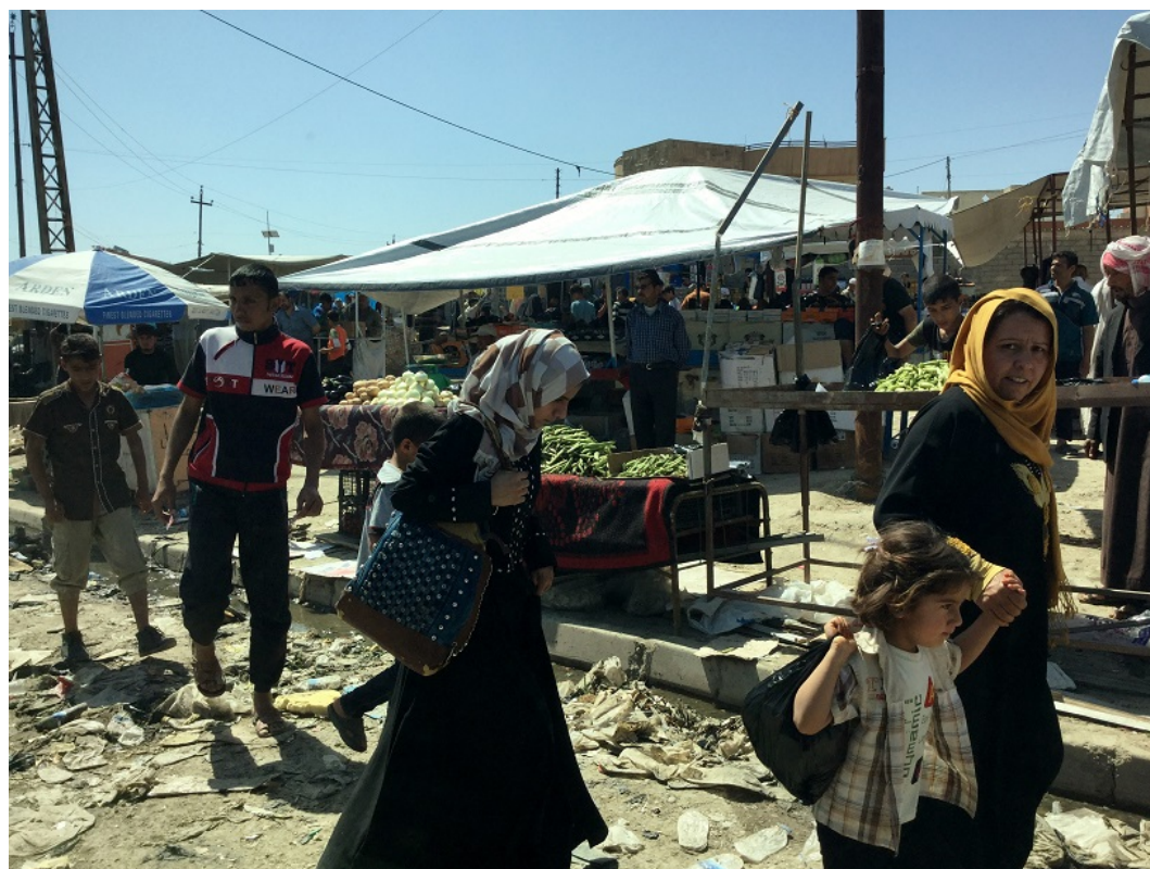
Markets are open in east Mosul, but purchasing power is still low.

At least half of the people who fled east Mosul have returned to their homes to reunite with families and look for work.