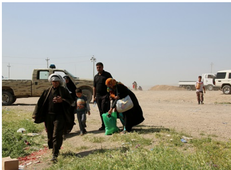
People fleeing Tel Afar reach the KR-I border.

As people continue to be displaced to eastern Mosul city by military operations in the west of the city, urgent, life-saving assistance will continue to be required. At the same time, resident, hosting and returnee communities need livelihood-generating programmes in close coordination with stabilization initiatives to re-establish infrastructure and services in the city. The flexibility of cash-based programming, in conjunction with income-generating projects and continued humanitarian support for the most vulnerable, will help manage the complexity of the humanitarian situation in eastern Mosul city.