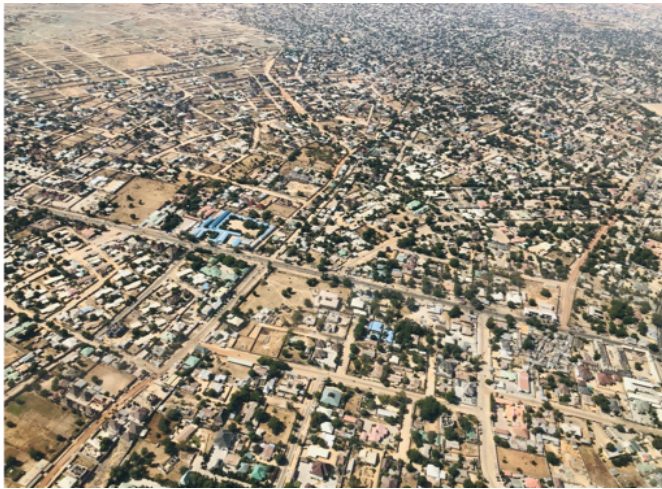
Figure 1: Aerial image of Maiduguri, 2020