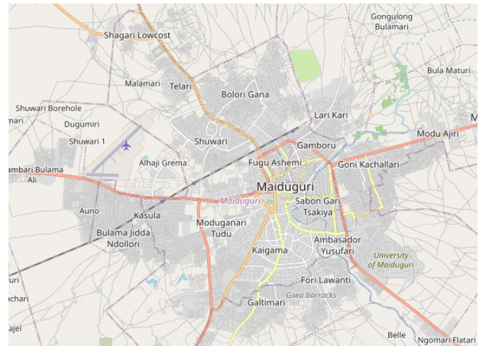
Figure 2: Map of Maiduguri