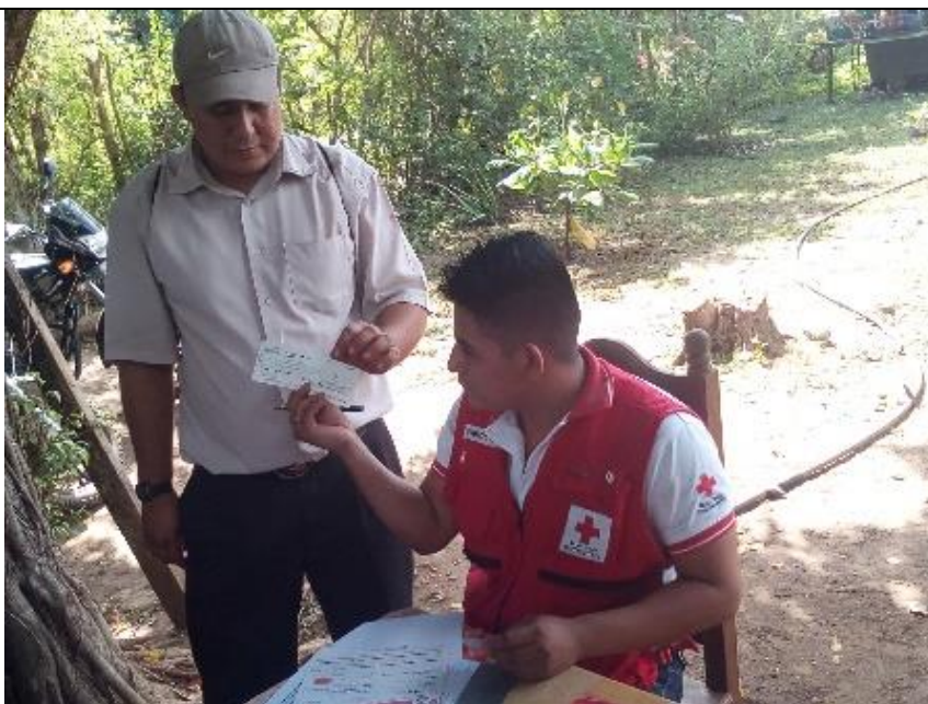
Guatemalan Red Cross providing vouchers as part of the CTP programme in the department of Retalhuleu.

Since the beginning of September 2017, heavy rainfall has affected Guatemala; the rainfall continued throughout October 2017, thus delaying the response activities in the departments of Suchitepequez and Retalhuleu. An additional DREF operation was launched on 10 November 2017 to assist affected families in the department of Alta Verapaz.