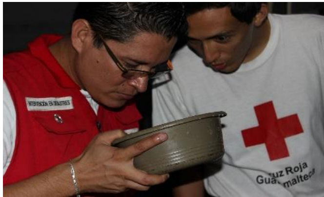
Artesian water well assessments in the department of Retalhuleu.

Output 4.2: Operational management is implemented per a comprehensive monitoring and evaluation plan.