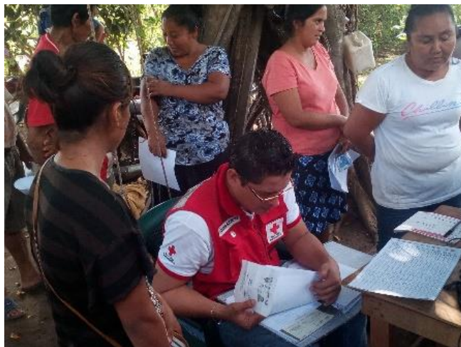
CTP distribution of vouchers in the department of Retalhuleu.

*Please that Note that the remaining two families in the department of Retalhuleu will receive vouchers to complete the planned 131 families.