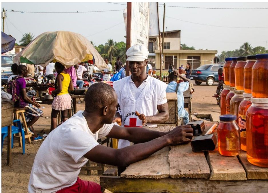
LNRCS volunteer engages with a market trader. LNRCS volunteers carried out focused community engagement activities focused on VD prevention during the festive season.

Six emergency appeals were launched to combat Ebola Virus Disease (EVD) outbreaks in Guinea, Liberia, Sierra Leone, Nigeria and Senegal, while providing coordination and technical support at the regional and global level. The Ebola emergency appeals have been revised to anticipate a longer-term vision as we are heading to the recovery phase. The revised appeals can be found at http://ifrc.org/en/publications-andreports/appeals/ and are currently planned to end in December 2017.