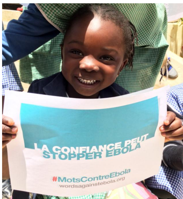
Students of an elementary school run by the Senegalese Red Cross, Jardin d'enfants de la Croix-Rouge, share their words against Ebola. The school is located just behind the Senegalese Red Cross headquarters in downtown Dakar. In May, the students will be putting on a school play on Ebola to educate communities on how Ebola is spread, and how to keep safe.

Six emergency appeals were launched to combat Ebola Virus Disease (EVD) outbreaks in Guinea, Liberia, Sierra Leone, Nigeria and Senegal, while providing coordination and technical support at the regional and global level.