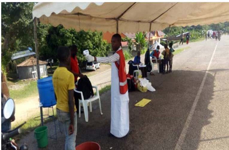
Uganda Red Cross volunteers conducting health screening on newly Congolese entering the country through Busunga crossing point, Bundibugyo district.

Considering URCS's experience and skill in EVD preparedness, it has been recognized as a key partner in community risk communication, social mobilization and community engagement, community-based surveillance and screening, Safe and Dignified Burial (SDB) and Psychosocial support (PSS). It is in line with these pillars that URCS has developed this Ebola Preparedness plan of action. As such, the proposed DREF operation seeks CHF 145,512 to support 144,300 people for 3 months.