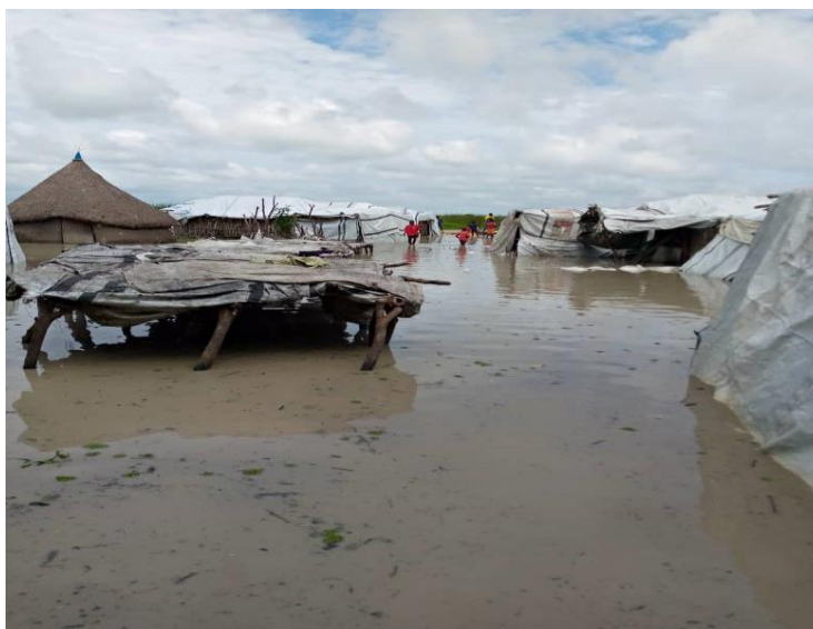
Flooded Houses in Gangyiel -Unity state.

The funding available at the moment will focus on delivering help to the most vulnerable people affected by the previous floods as well as those affected by the new flooding. Areas of focus will be on WASH and Cash Programming. IFRC will organize a partners' call to announce the revised appeal and seek additional support. Also, SSRC with the support of IFRC will reach out to BHA/USAID and DFID/UKAID in country to ask for their contribution to the revised appeal.