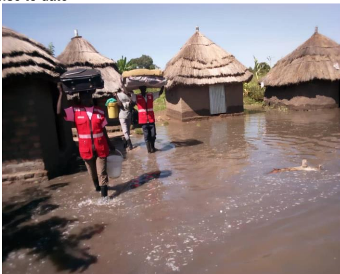
South Sudan Red Cross's volunteers are assisting flood affected families.

In the Northern Bahr-el Gazal counties of Aweil Centre, Aweil West (Nyamlel) and Gokmachar, the SSRC was already responding to floods that hit in June 2019, and have reached 49,560 people with multi-sectorial assistance supported by the IFRC Disaster Relief and Emergency Fund (DREF), Danish Red Cross, ICRC and Austrian Red Cross. For a brief update on actions achieved through the DREF operation and this appeal, the SSRC through its network of branches in the affected areas conducted rapid needs assessments in Jonglei (Bor South, Nyirol and Akobo), Warrap (Tonj North) and Upper Nile (Mawuit) in late October 2019. A total of 113 volunteers were deployed in the affected areas to assess the damage and helped people to evacuate. In the Northern Bahr el Gazal counties of Aweil Centre, Aweil West (Nyamlel) and Gokmachar, the SSRC supported 49,560 people in Aweil with multi-sectorial assistances, including WASH, non-food items and Psychological support, supported by the DREF (launched on 17 June 2019) combined with support from Danish Red Cross, ICRC as well as Austrian Red Cross.