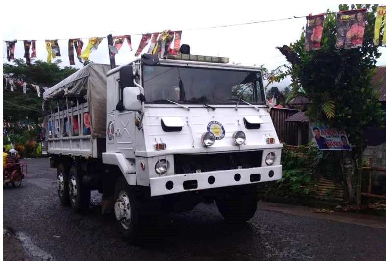
PRC supported the transportation of people to the evacuation centres in support to the pre-emptive evacuation done by local government.

Prior to Amang's landfall, necessary preparedness was conducted by communities and government offices based on learning from the previous similar forecasts. With an anticipation of significant impact, government authorities carried out pre-emptive evacuation for families living near the coast, riverbanks, landslide prone areas and other vulnerable places. Prior to landfall, there were pre-emptive evacuations for 5,256 families or 21,006 people from the provinces of Labay, Camarines Sur, Masbate, Sorsogon, Eastern Samar, Northern Samar, Souther Leyte, Biliran, Compostela Valley, Agusan del Norte, Dinagat Islands, Surigao del Norte and Surigao del Sur. Part of the preparedness activity was the suspension of classes in 350 cities/municipalities in Regions V, VII, VIII, X and Caraga.