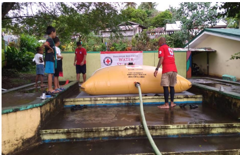
PRC Camarines Sur Chapter installed a 5,000-litre bladder in Tambo Elementary School evacuation centre to provide displaced population access to safe drinking water.

PRC monitored the weather disturbance since it was spotted by weather agencies through its Operations Centre which operates 24/7. In accordance with PRC standard operating procedures, PRC National Headquarters instructed Chapters to be ready to respond up to their required capacity to deliver assistance to affected communities with the basic services – welfare, first aid, etc. Chapters in likely affected areas were informed to take preparedness measures. The Chapters communicated with their Red Cross Action Teams volunteers and community Red Cross Volunteers (RCAT and RCAT143) for information and to start implementing early warning measures as Amang (which was a low-pressure area by then) approaches. National disaster response teams, emergency response units for water, welfare and health services personnel were alerted for possible deployment.