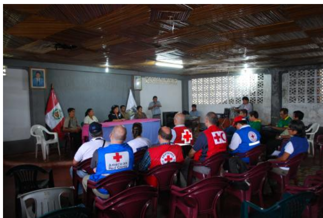
The National Society participated in a joint assessment mission with UN Agencies, Movement components and NGOs.

developed with other humanitarian organizations and governmental offices such as the Ministry of Health. A similar structure of coordination is established at the regional level, with the PRC's Maynas branch in direct contact with Loreto's governmental authorities and actors.