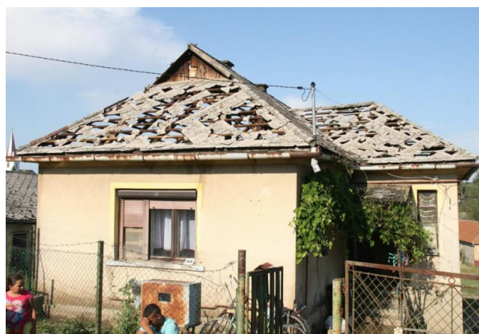
One of the damaged roofs in the village of Megyaszó.

According to the weather forecast of the Hungarian Meteorological Service for the coming ten days, continued hot weather can be expected with additional storms and rains occurring and putting these and other houses in these geographic locations at risk.