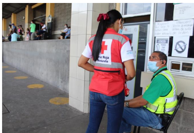
Honduras Red Cross volunteers providing services in the main bus station in San Pedro Sula, July 2021.

Through coordination platforms and several reports in unofficial media and communication from the Guatemalan Institute of Migration 1 , the Honduran Red Cross (HRC) has received reports of a new caravan of Honduran migrants expected to leave for Guatemala heading towards Mexico and the United States at the end of July (between 25-31). The new caravan is composed mainly of Hondurans and migrants from other Central American countries, South America, Haiti and Cuba, many of whom are already temporarily settled