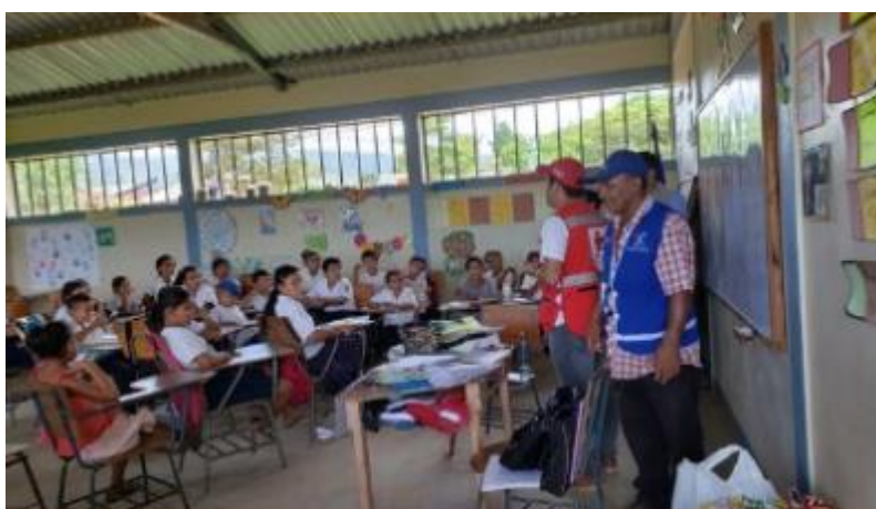
Photo: Awareness sessions in schools in the Department of Olancho as part of the National Emergency campaign against Dengue. June 2019.

Honduras is experiencing an outbreak of dengue fever. The number of cases began to climb as of April 2019, and by Epidemiological Week 23 (2-8 June) a total of 11,436 cases had been reported, of which 7,395 (64.7 per cent) were cases of dengue with no warning signs and 4,041 (35.3 per cent) were severe cases. So far 63 people are reported dead, of which 33 are laboratory-confirmed (1.55 per cent mortality) (see figure attached). During this same period, 12 departments (66.6 per cent of the entire country)