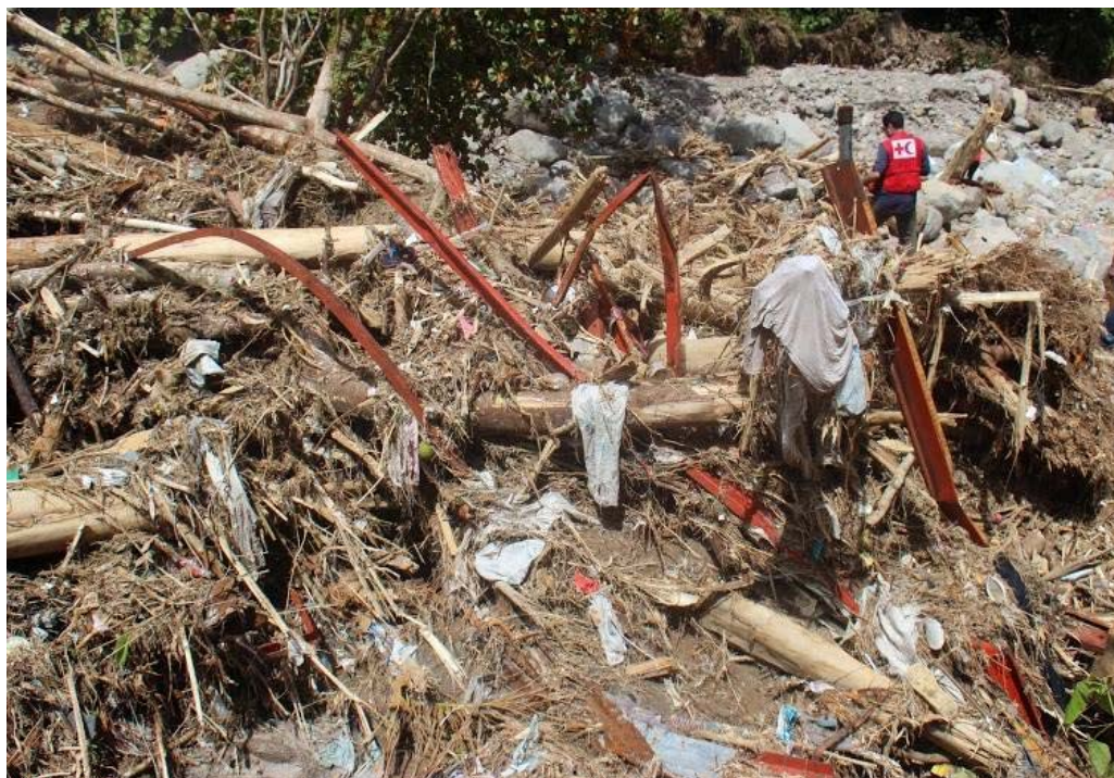
Assessments underway in the Pichelin community.

10 September 2015: Emergency Appeal launched for 979,749 Swiss francs to assist 12,000 families for 9 months