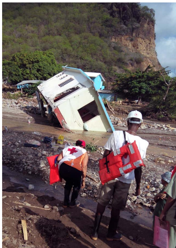
DRCS carry out further assessments in the community of Coulibistrie.

Operational objective: respond to the immediate needs of 12,000 people affected by Tropical Storm Erika. The Plan of Action focuses on supporting the National Society to provide assistance including: cash transfer and basic household non-food item distributions; health and psychosocial support services; water, sanitation and hygiene promotion activities; Restoring Family Links (RFL); and shelter support in the affected communities.