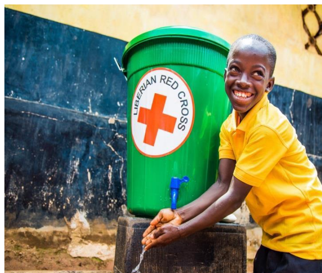
School children practicing proper handwashing before classes start in Montserrado, Liberia in October 2015. Supported by the IFRC, LNRCs has been distributing handwashing kits, soap, chlorine and no-touch thermometers to over 500 schools across the country

This achievement owes much to Red Cross National Society staff and volunteers who worked tirelessly towards halting the spread of the disease. The National Societies in Guinea, Liberia and Sierra Leone have played a critical role in community engagement, without which the Ebola response and prevention would have been impossible. As a result of National Society activities aimed at reducing the spread of the disease, case prevalence began to decline. However, the introduction of an EVD case remains a risk as long as cases exist in any country. Good preparedness and timely and effective response, can, however, still enable the National Societies in the three most affected countries, and in other countries, to halt the spread of the disease.