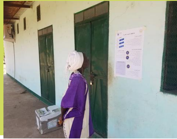
A woman reading a COVID-19 poster in Kauda, South Kordofan (June 2020)