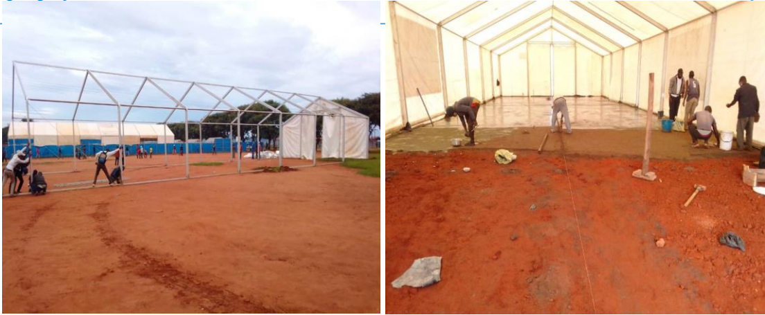
Due to rising numbers of COVID-19 new infections in Dzaleka Refugee Camp and Dowa district in general, the Reception, Isolation and Quarantine Centre is being extended in order to treat more patients.