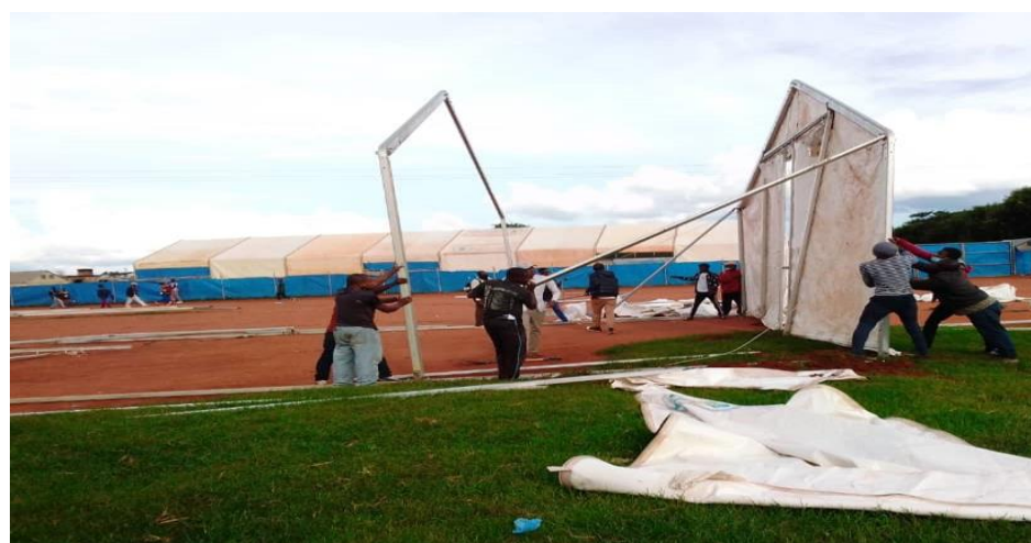
Extension of COVID-19 Reception, Isolation and Treatment facility in Dzaleka Refugee Camp in order to meet the demand amid rising cases of COVID-19 patients.