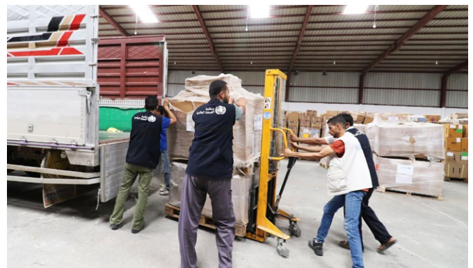
WHO delivering 27 cholera kits, enough for 2,700 patients to Yemen on 27 August 2018.

teams and various interventions in cholera risk areas. From January to June, the Cluster reached 7.1 million people through one or a combination of emergency water supply, sanitation, basic hygiene and awareness activities.