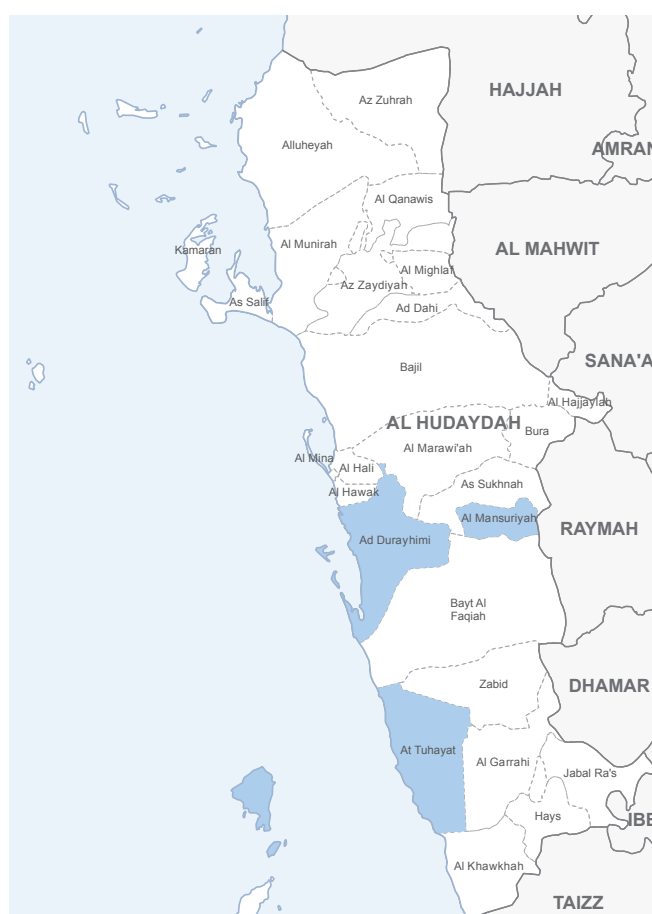
Map of Al Hudaydah showing districts with ongoing clashes.

The only public health facility in Ad Durayhimi town is no longer functioning and medical staff have fled, leaving injured people without access to proper medical care. Fighting has also disrupted markets and the movement of traders, prompting some markets in Ad Durayhimi and At Tuhayat districts to close. Partners have identified more than 51,000 displaced households from Al Hudaydah Governorate, of which more than 44,700 households have received rapid response assistance.