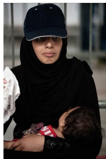
Syrian family awaiting registration outside the One Stop Centre in Preševo, South Serbia @UNHCR/Imre Szabo

Intention to apply for asylum (Source: Ministry of Interior)