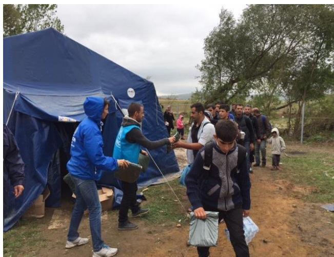
UNHCR staff distributing raincoats to refugees arriving from FYR Macedonia at Miratovac RAP