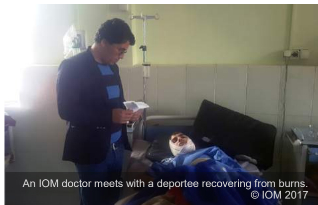
An IOM doctor meets with a deportee recovering from burns.

IOM provided post-arrival humanitarian assistance to 271 (5%) undocumented Afghans arriving from Iran at its Transit Centers in Herat and Nimroz, including 80 unaccompanied migrant children and 17 people with special medical needs.