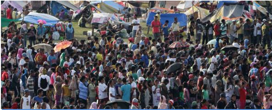
The grandstand in Zamboanga City Sports Complex is stretched well-beyond its capacity for human habitation. It now houses 50,343 evacuees.