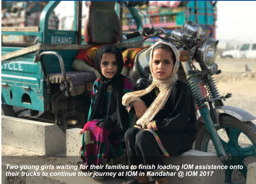
Two young girls waiting for their families to finish loading IOM assistance onto their trucks to continue their journey at IOM in Kandahar