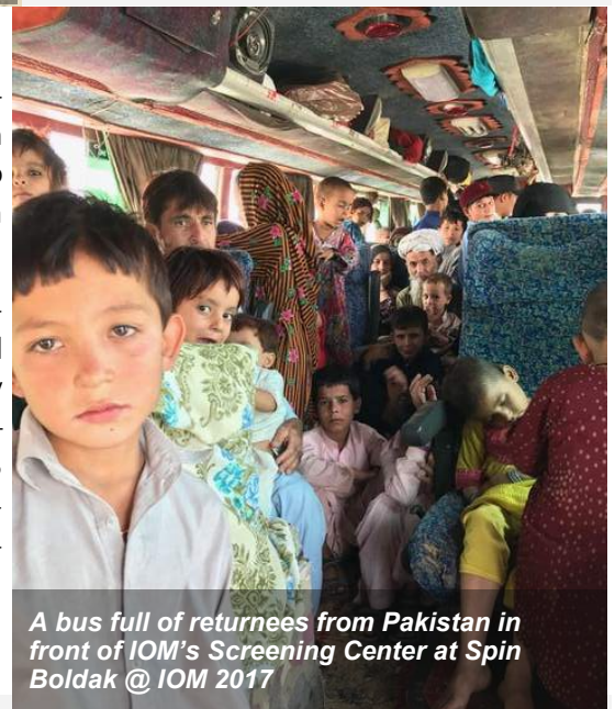
A bus full of returnees from Pakistan in front of IOM's Screening Center at Spin Boldak @ IOM 2017

Of the total returnees, 1,953 were spontaneous returnees and 32 were deported. This number is a 5% increase compared to the previous week. The total number of undocumented Afghan returnees from Pakistan since 01 January 2017 is now 79,822. IOM provided post-arrival assistance to 96% of undocumented Afghan returnees from Pakistan (1,898 individuals), including 1,675 individuals in poor families, 220 individuals in single parent families and 3 special cases. Additionally, IOM provided assistance to 9 individuals in 2 poor families who had returned between June 30 and July 3, at a time when the IOM Transit Center at Turkham remained closed for security reasons.