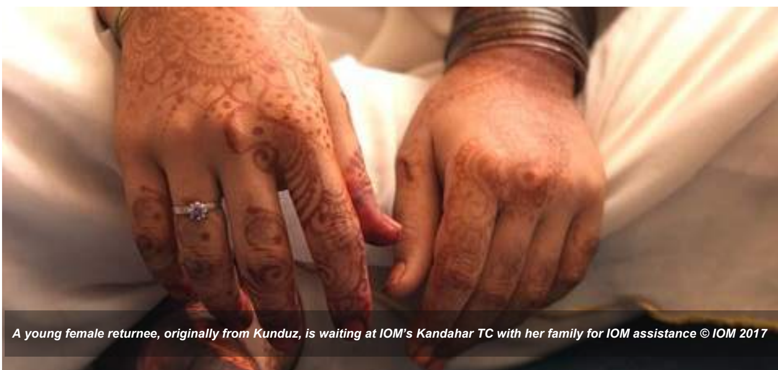
A young female returnee, originally from Kunduz, is waiting at IOM's Kandahar TC with her family for IOM assistance