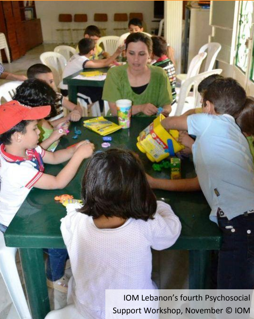
IOM Lebanon's fourth Psychosocial Support Workshop, November

This report is produced by the International Organization for Migration (IOM) on its humanitarian response for the crisis in Syria. The summary covers events and activities until 15 November.