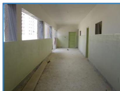
Site visit to B1 school collective shelter in Dahiyat Qudsaya on 12 Nov 2012