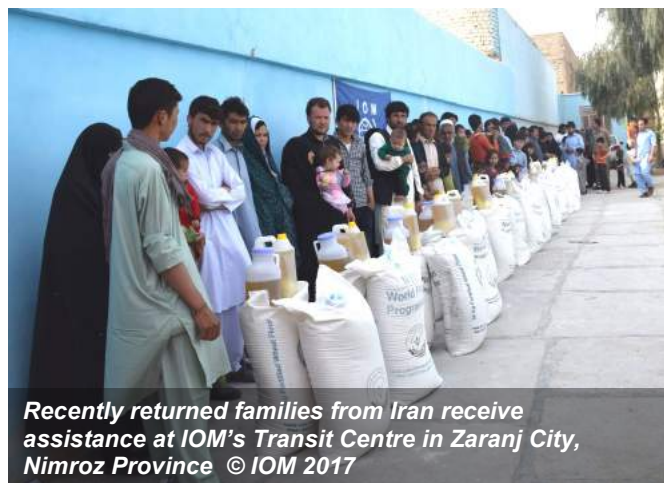
Recently returned families from Iran receive assistance at IOM's Transit Centre in Zaranj City, Nimroz Province

IOM provided post-arrival humanitarian assistance to 260 (6%) undocumented Afghans deported from Iran at its Transit Centers in Herat and Nimroz, including 50 special cases, 15 medical cases and 71 unaccompanied migrant children .