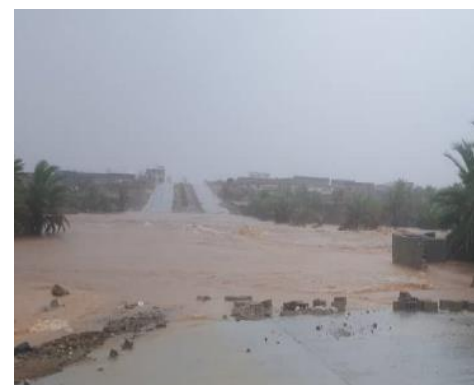
Flash Flood - Al Mahrah