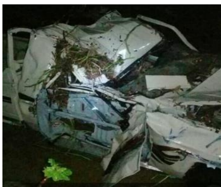
Flooded car - Al Mahrah