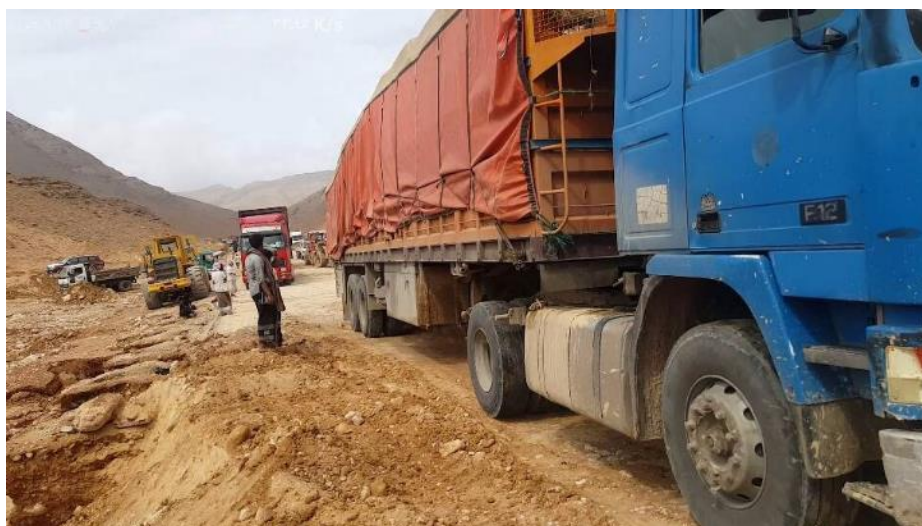
YRCS Al Mahrah branch helping clear the international road in Al-Ghaydah

II. Al-Mahrah: YRCS Al Mahrah branch is involved in distribution of relief items, such as water, drinking water and first aid service. At the time of writing this bulletin, one team from the Al Mahrah branch is with the people isolated by flood in Alaibri, providing emergency help (risk awareness and first aid services). They also help in food distribution and evacuation of people affected by floods and support authorities in clearing roads.