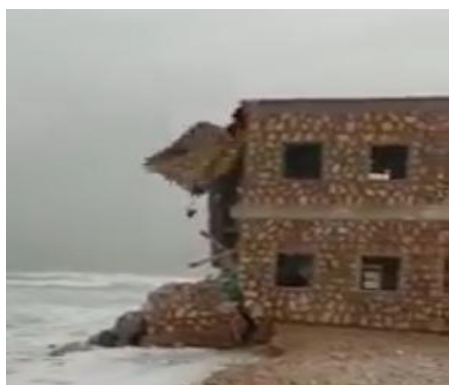
Damaged building – Al Mahrah