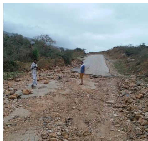
Damaged road - Socotra