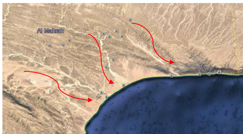
Ongoing Floods – Al Mahrah