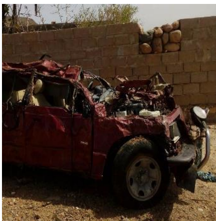
Flooded car - Socotra