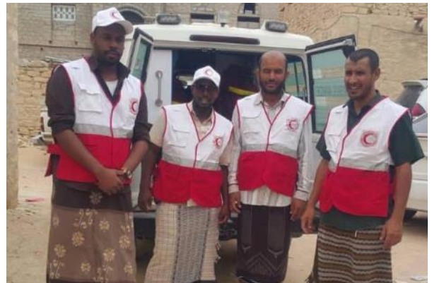
First aid team with an ambulance moved Hawf