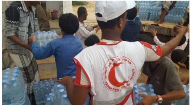
YRCS participate in drinking water distribution

Emirates Red Crescent: In the morning of May 26 th , Emirates Red Crescent sent a plane holding 40 tons of Relief goods (food and non-food items) have been sent to Socotra Island.