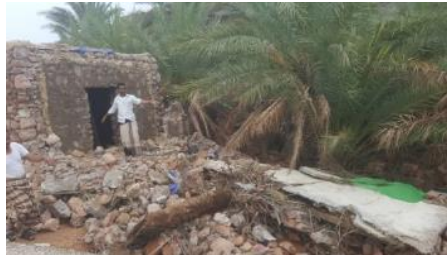
Partly damaged house. Beit Qurhat - Hadibu