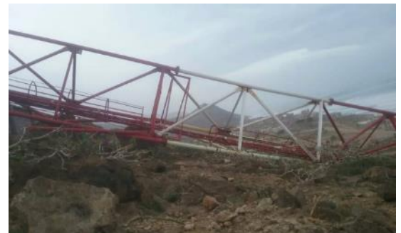
Collapsed telecommunication tower in Hawf