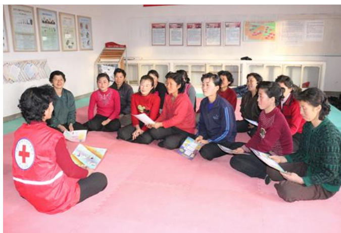
DPRK RCS Volunteers in H1N1 preparedness training in Ponghung ri, Kumya county, South Hamgyong province.

The Democratic People's Republic of Korea Red Cross Society (DPRK RCS) is meeting daily with the MoPH to coordinate activities and better understand the needs and gaps. The IFRC country office in Pyongyang met with WHO on Tuesday 24 January and were briefed along with other UN and NGO agencies on the developing situation. The IFRC and DPRK RCS met on 25 January to assess how Red Cross can contribute to efforts in limiting the outbreak. The DPRK RCS may require support in assisting the MoPH with procurement of some key consumables such as Rapid Testing Kits and support social mobilization focusing on prevention and surveillance.