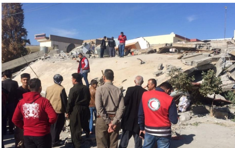
Assessment visit in Darbandikhan.

The Iraqi Red Crescent Society (IRCS) has announced the increase in the numbers of the earthquake victims that hit the cities of Iraq to 10 dead and more than 500 injured people. Most of them are from Sulaymaniyah governorate areas, and Kalar, Darbandikhan, Khanaqin and Halabja. More casualties are expected due to aftershocks that occurred on the night of 13 November 2017.