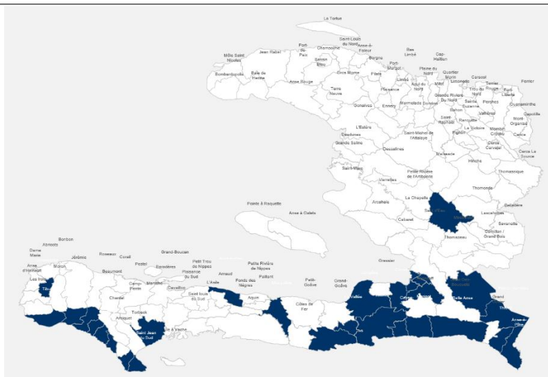
Communes most affected by flooding following the passage of Tropical Storm Laura, as of 25 August 9 am