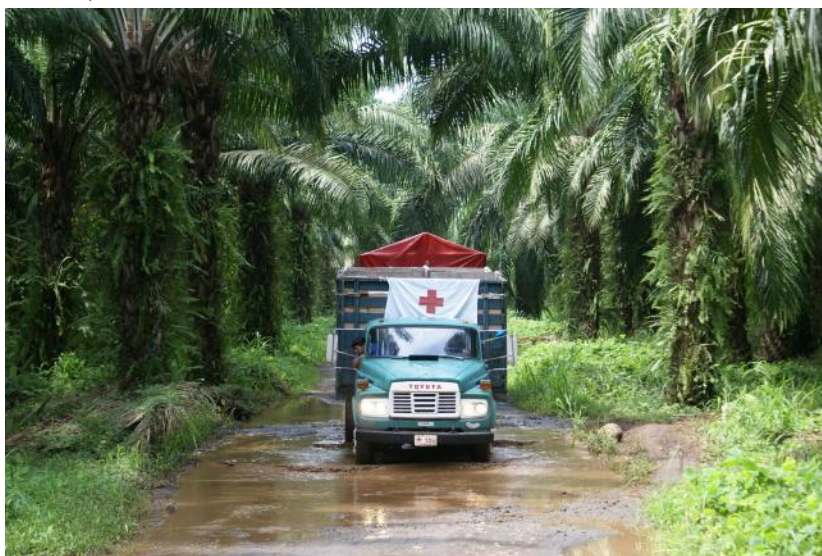
The GRC provided assistance to many hard-to-reach communities that were affected by Tropical Storm Agatha.

The outcome of relief distributions was achieved 100 percent, with 1,500 relief kits distributed to six of the most affected communities. Additional relief distributions were coordinated with Partner National Societies reaching a total of 7,930 families. Reduction of health risks was accomplished through community participation in workshops, including: 2,658 individuals in sexual and reproductive health, 147 families in disease prevention and 927 persons in psychosocial support. Health risks were also reduced through vector control activities, including community clean-up activities, which benefitted 71 families and fumigation of homes, which reached 530 households. This exceeds the outcome of providing comprehensive emergency health services to 500 families.