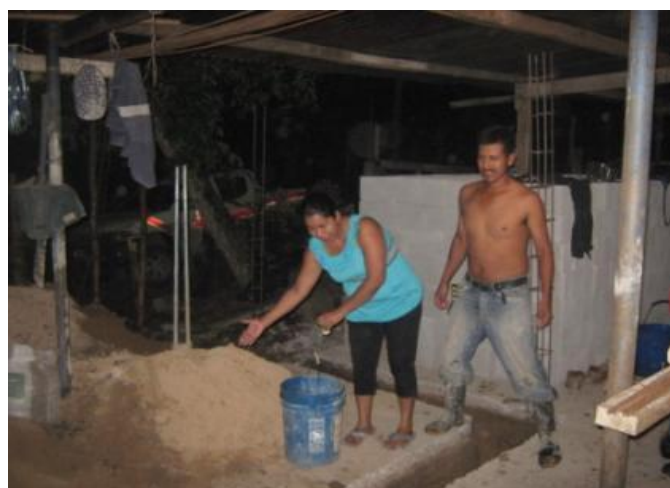
Family members from affected communities supported the works to build back their homes. The operation reached 489 families with construction materials, training and monitoring activities.

Impact: Whilst the original shelter objective aimed to support 500 households affected by Tropical Storm Agatha, the region faced constant precipitations which continued to wreck damage throughout the Guatemalan western coast and central highlands. Considering this, the GRC strategically divided its focus to incorporate also collective centres within the sponsored reconstruction activities. At the end of the operation, the GRC's shelter programme had effectively supported 489 households (2,250 persons) with construction materials while also built six collective centres and repaired four collective centres, which supported an additional 1,200 households (some 6,160 persons).