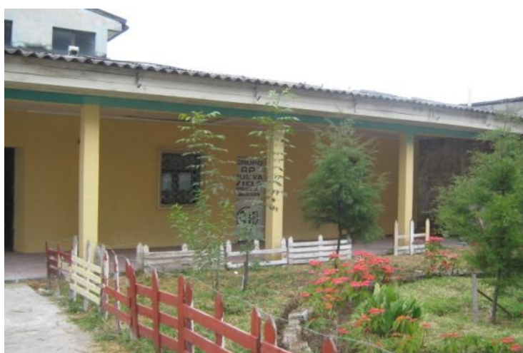
The community of Minerva, in Quetzaltenango now enjoys a fully refurbished collective centre.

disrupt deliveries. Another example of the success of the shelter activities was that neighbours formed partnerships while carrying out the constructions and reparations, working together on each other's homes, enabling a faster construction and the exchange of knowledge and skills. As mentioned before, 489 household were reached through this project: 84 families in Amatitlán, 128 families in Quetzaltenango, 138 families in Morales and 139 families in Retalhuleu.