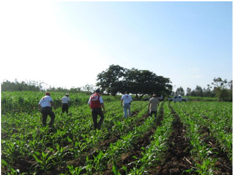
The Guatemalan Red Cross agronomist and GRC volunteers monitor new corn crops. A total of 583 families were reached with agricultural inputs and technical support as part of recovery activities.

Summary: After suffering from one of the most severe rainy seasons in decades, Tropical Storm Agatha brought additional strong and persistent rains to Guatemala in late 2010. The rains damaged homes, infrastructure and crops, and created concerns regarding water, sanitation, health and food security. The Guatemalan Red Cross drew up a plan of action with the aim to support 1,500 families with their immediate needs through distribution of relief items, emergency health and care, water, sanitation and hygiene promotion, repair to homes and recovery of crops. These activities were managed by the GRC with support from the Partner National Societies (the Netherlands Red Cross, the Norwegian Red Cross and the Spanish Red Cross) and the IFRC.