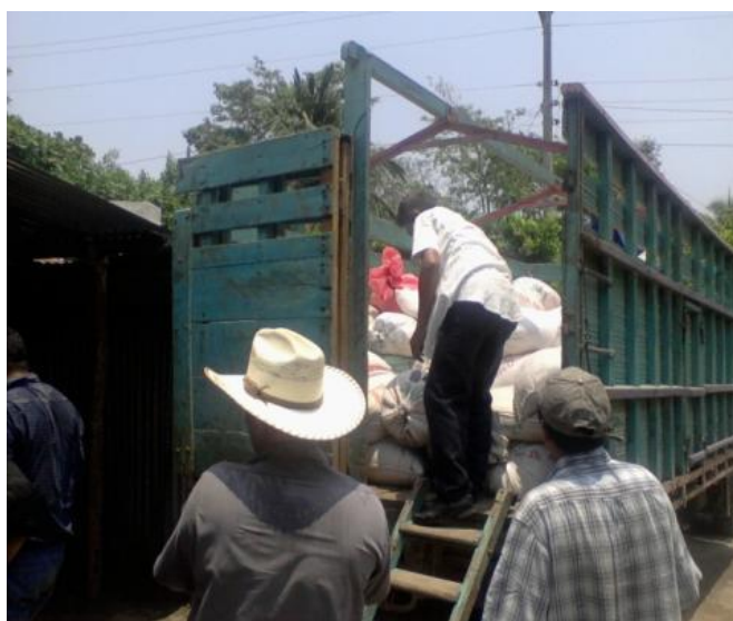
A total of 583 beneficiaries received corn or bean seeds, in addition to fertilizers, and technical inputs.

The households receiving support for corn production received 13.6 kilos (30 pounds) of corn