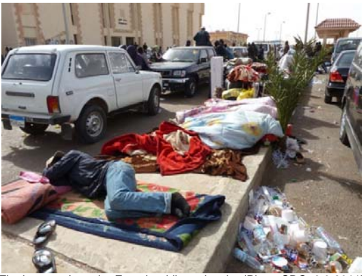
Fleeing people at the Egyptian-Libyan border (Photo SDC, 6.3.2011)