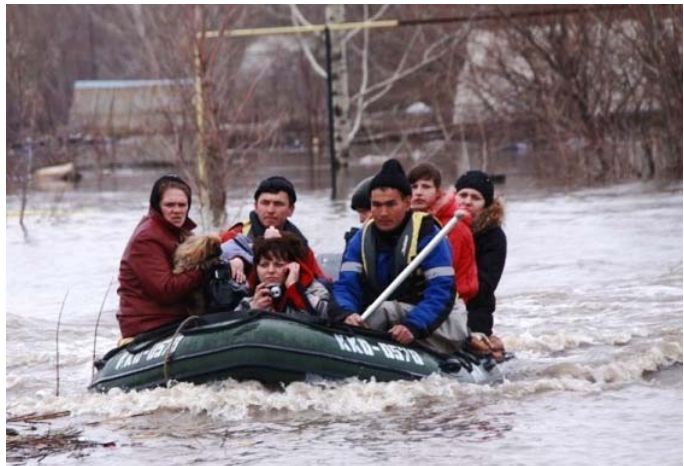
About 9,000 people have been affected by floods in Western Kazakhstan.

Summary: Abundant snowmelt and heavy rains on 9-15 April raised water levels in rivers that flooded 20 settlements in Western Kazakhstan region affecting 9,000 people. Around 300 km of roads and several thousand hectares of farmlands have been destroyed; dams, bridges, power lines, telephone lines and gas pipelines have also been damaged. More than 1,000 heads of livestock have been killed. The government evacuated people from the floods affected areas, funds and relief items have been allocated from the government reserves to control the floods and address the consequences.