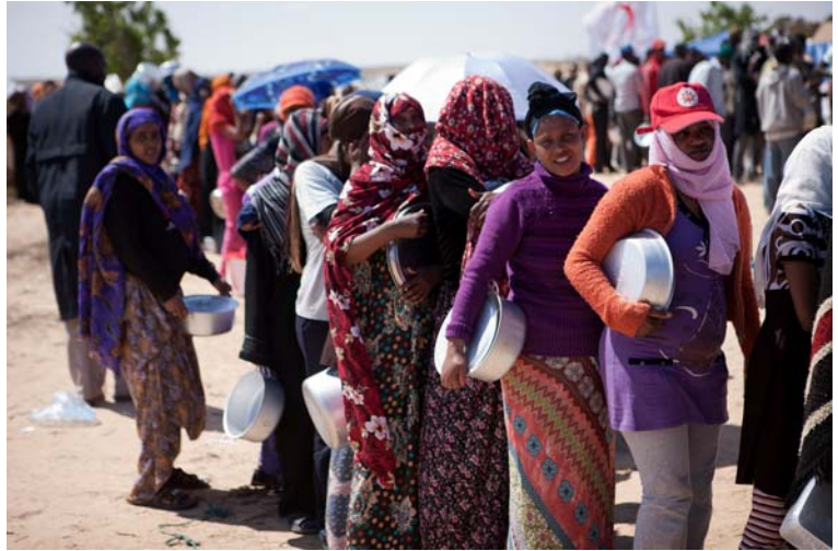
Women wait in line for food at one of three food distribution points at Choucha camp.

UNHCR's Goodwill Ambassador Angelina Jolie travelled on 5 April to the Tunisian-Libyan border to urge greater international support for people fleeing Libya.