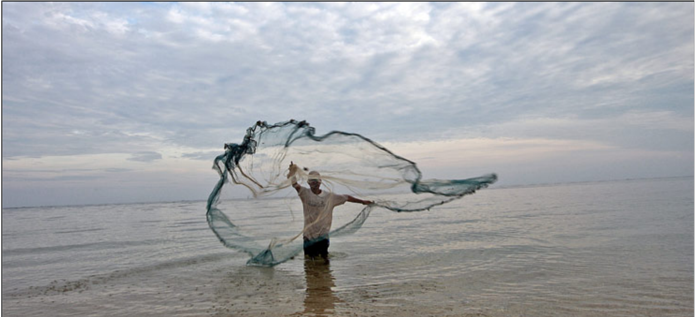
Casting a net on Mother Nature. Sea level rise and other impacts of climate change could threaten the livelihood of island communities, hence the recent interest in geoengineering.

Geoengineering techniques are currently experiencing a surge of interest, as it has become widely accepted that global warming is both real and potentially problematic. The historical failure to control emissions and the possibility that so-called tipping points in the Earth's climate system are close to hand have generated a degree of urgency in efforts to research and implement potential solutions. The discourse has thus far been driven by scholarly communities in Europe and the US, and thus lacks perspectives from other key regions such as the Asia-Pacific. This has to change. As a region that may be significantly affected by climate change, Asia needs to have a voice in this emerging debate.