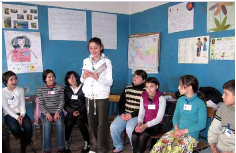
Internally displaced students in an "Abkhaz school" in Georgia.

Meanwhile, the parallel ministry also runs two resource centres serving schools for ethnic Georgian students in the Upper Abkhazia and Gali regions of Abkhazia. 52