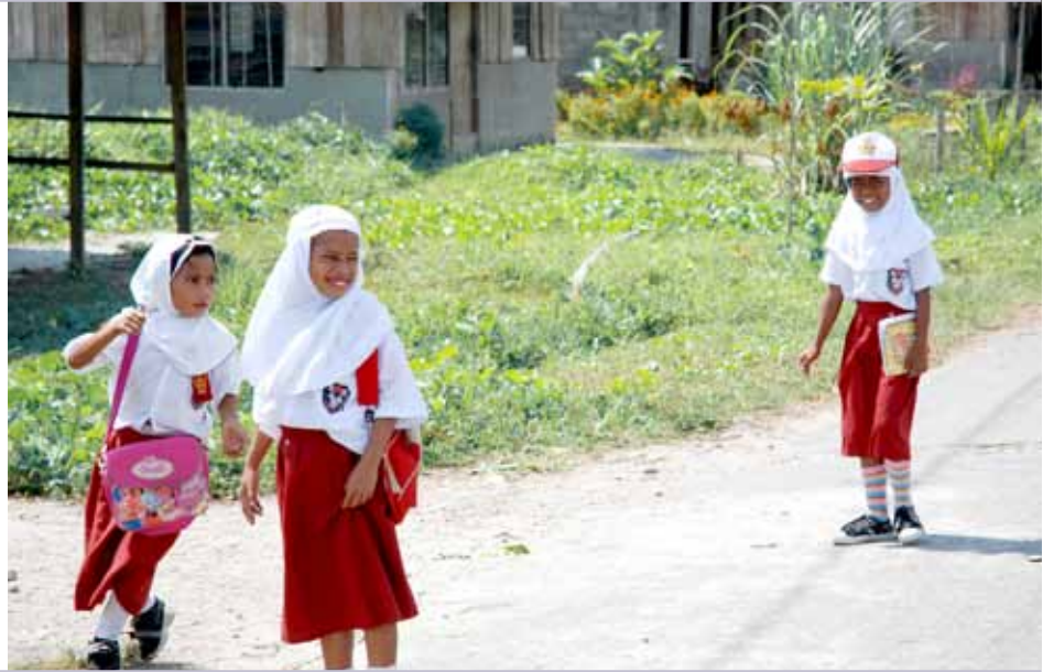
Young schoolgirls in a village to which IDPs were resettled in West Seram, Maluku province, Indonesia (Photo: IDMC/Frederik Kok, December 2007).

... to ensure the right of access to education on a non-discriminatory basis". 4