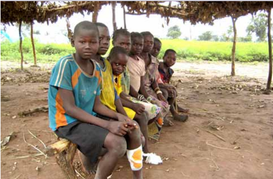
Displaced children in the Kabo IDP site, Central African Republic, sit in the only temporary classroom still standing after heavy rains (Photo: IDMC/Laura Perez, July 2008).

though processes of certification. Teachers should be recruited through proper selection procedures from the displaced community, and should be properly rewarded. 21