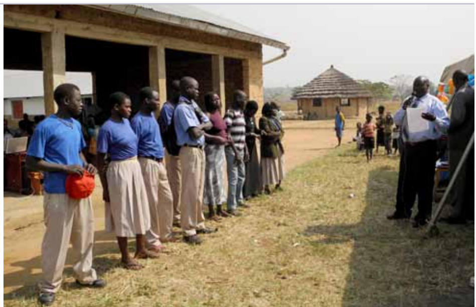
Youths graduating from an education programme for former IDPs in Gulu district, Uganda. During their displacement they struggled to access adequate education in IDP camps (Photo: IDMC/Alice Farmer, January 2011).

The paper takes as a case study the situation in the Republic of Georgia. The situation there illustrates the complexity of issues facing those responsible for the provision of education to internally displaced children, and both good and bad practices which arise. Finally, it recommends practices to promote the integrated education of IDPs in any displacement situation.