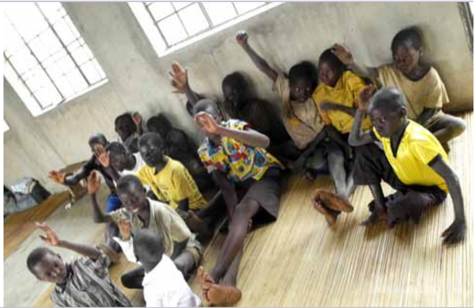
Formerly internally displaced children who have returned to the school in their village of origin, Gulu district, Uganda (Photo: IDMC/Alice Farmer, January 2011).

try. IDPs may take refuge within safe reach of existing facilities but may not understand the local language of instruction. Where there is an immediate prospect that IDPs may be able to return, separate educational facilities may be appropriate to focus on language maintenance and skills for reintegration. 28