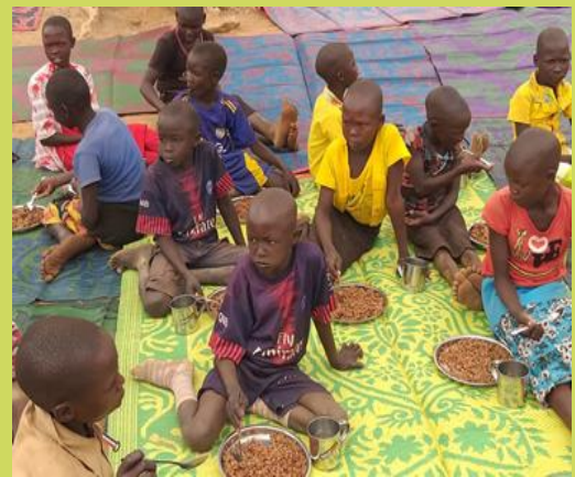
WFP school feeding program in South Kordofan