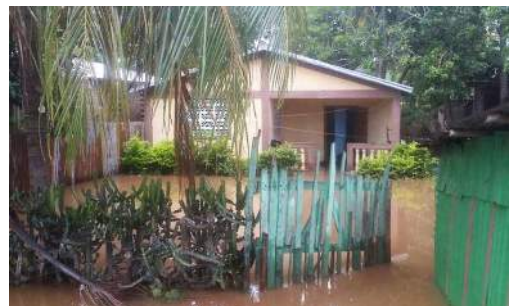
Flood-affected home in Haiti