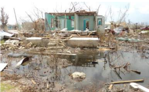
Destroyed home in Barbuda