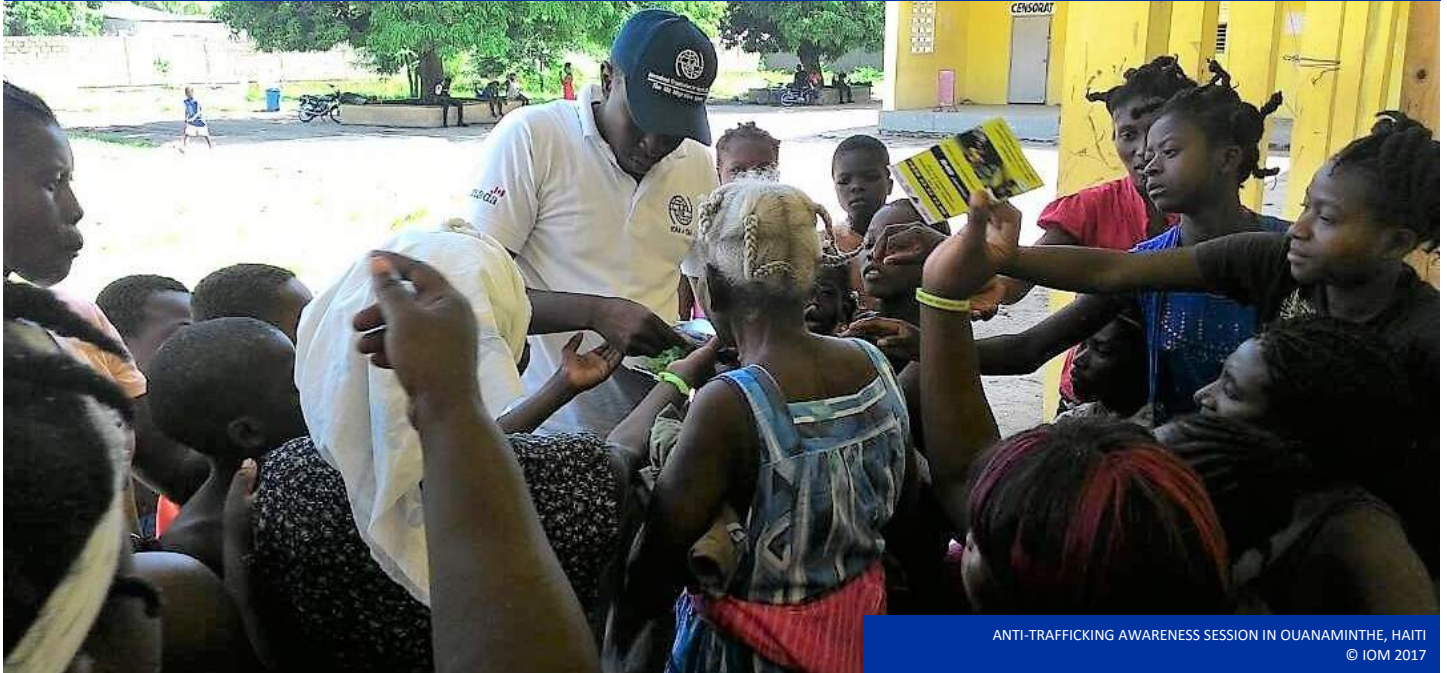
ANTI-TRAFFICKING AWARENESS SESSION IN OUANAMINTHE, HAITI