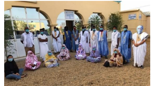
Community Watch volunteers trained by UNHCR

Since the beginning of the pandemic, UNHCR has supported the Mauritanian Government's COVID-19 Response Plan, focusing its interventions in the Hodh Chargui region where the Agency and its partners operate in the framework of the Refugee Coordination Model (RCM). At the same time, refugees, including refugees in urban centers, are fully included in the Government's response and COVID-19 refugee patients are treated in national health structures. At the request of the governor of Hodh Chargui, UNHCR together with the NGO Alima and WHO, trained thirty-two youth volunteers to reinforce the community surveillance system. In addition to this, UNHCR has donated Personal Protective Equipment (PPEs) to the health center in Bassikounou which serves as a referral hospital for confirmed positive cases in the department.