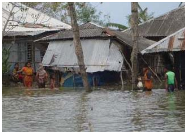
AILA affected area

Shayamnagar and Asasuni upazila were affected by wind driven surge which was 4-5 feet above normal astronomical tide. 9 unions of Shayamnagar and Asasuni were flooded adversely. Total 88 km of ring embankments damaged and 1 lakh people were affected in these 2 upazilas. 96 and 40 shelters were opened in Shayamnagar and Asasuni upazilas respectively. Dwellers of Kaliganj and Debhata upazila were also water logged. Army, Navy, Coast Guard and volunteers of different Government and non-government organizations have been involved in rescuing, relief and rehabilitation.