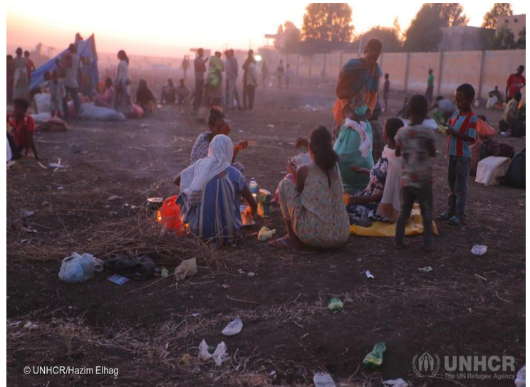
Ethiopian refugees, fleeing clashes in the country's Tigray region, rest and cook meals near UNHCR's Hamdayet border reception centre after crossing into Sudan.

Lugdi in Gedaref State: Refugees arriving at Lugdi continue to be transported by the Sudanese government to Village 8 further away from the border. There are now some 11,000 people at the site and UNHCR has received approval by the government to set up a reception area to facilitate registration. While refugees at Lugdi may eventually be relocated to refugee settlements, immediate improvements to the site are required. UNHCR and Sudan Red Cross (SRC) continue site planning and have begun to allocate plots to families, as