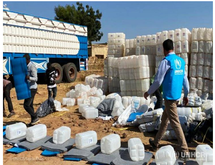
The distribution of core relief items including blankets, mats, jerry cans and other items upon arrival to Hamdayet reception centre.

At the transit centre, hot meals are being provided by Muslim Aid with the support of WFP food and kitchen utensils, but it is still not enough for the number of people. WFP continues to provide High Energy Biscuits to the refugees upon arrival and prior to relocation to Um Rakuba camp. UNHCR through COR continues to distribute core relief items including blankets, mats, jerry cans and other items upon arrival at the reception centre. Water is trucked into the reception centre and to the existing water treatment that needs rehabilitation. WES with the support of UNICEF constructed four bladders to support the site. Water supplies are chlorinated using tablets delivered by Ministry of Health who also provided six cartons of water purification tablets. With water quantities still insufficient, people are resorting to the use of the Tikeze river for multiple purposes, which is a major health concern. Meanwhile, Tawaki supported by UNICEF constructed 30 latrines and MSF began constructing drop hole communal latrines.