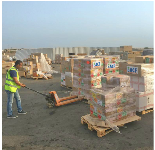
Logistic Cluster coordinated transport of 152 mt relief for partners, Yemen.

WHO has finished loading trucks containing 70 tonnes of cholera treatment supplies which arrived at Sana'a airport last week.