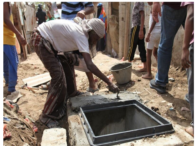
A construction worker while repairing underground sewage pipes at Dar Sa'ad district, Aden. The repairing of underground sewage was conducted as part of UNICEF, World Bank and WHO's Emergency Health & Nutrition Project intended to control cholera and support Yemen's health system.